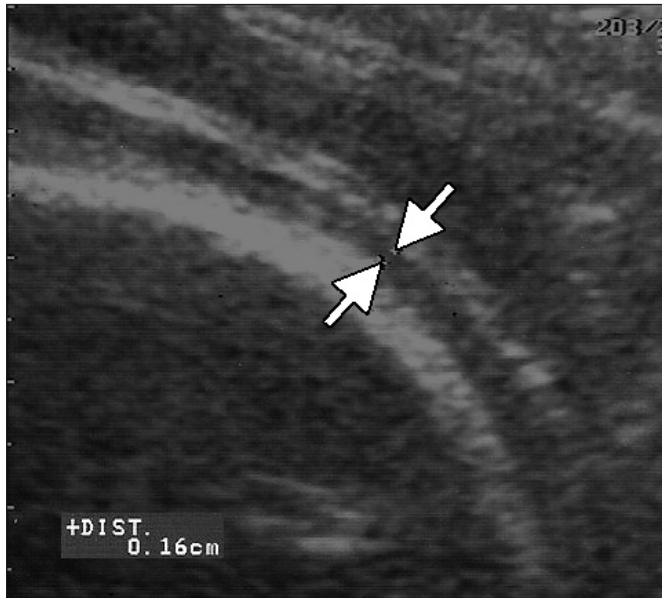
Figure 1. Transabdominal longitudinal sonogram showing the LUS thickness of 1.6 mm (between arrows).