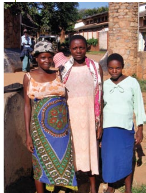
International Women's Health Photo Contest Third Place: Dr. Paul Thistle's "Mothers Anticipating Labour"

In both Uganda and Haiti, the FIGO-supported initiatives are designed to help health centers in selected regions improve the quality and accessibility of emergency obstetrical care. Both interventions will use the three delay model to train health professionals at different levels of care to access emergency obstetrical care when dealing with life-threatening complications.